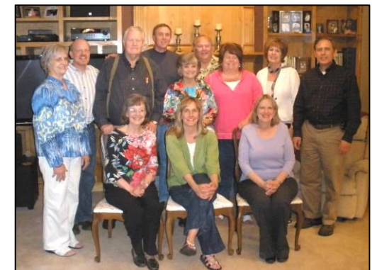
Our 2010 ADT graduating class and trainers

In-class and in-field discipleship training, plus one-on-one mentoring. Qualifies as a 3-hour Luther Rice Seminary course.